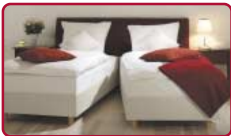
Clever: the link system is functional, and the castors at the top of the bed make life easier.