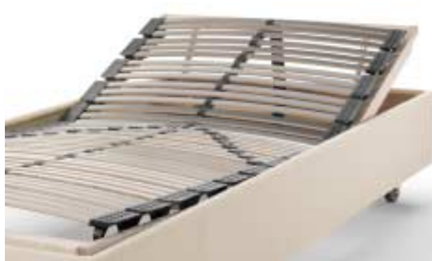
sleep factory*: perfect suspension...

Our experts on sleep systems will be pleased to provide you with detailed advice. They are entirely competent, and familiar with the requirements of every different type of hotel. They will work with you to find out which bed system is the most suitable for your hotel. Furthermore, they will provide you with exact calculations to enable you to make a sensible investment decision. Please contact us if you would like to have some really competent advice on this subject.