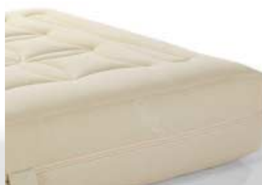
mattress variety ...