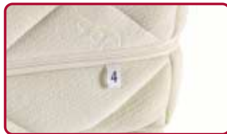
Planned down to the details: the numbers on the corners of the mattresses help with orientation when turning them.